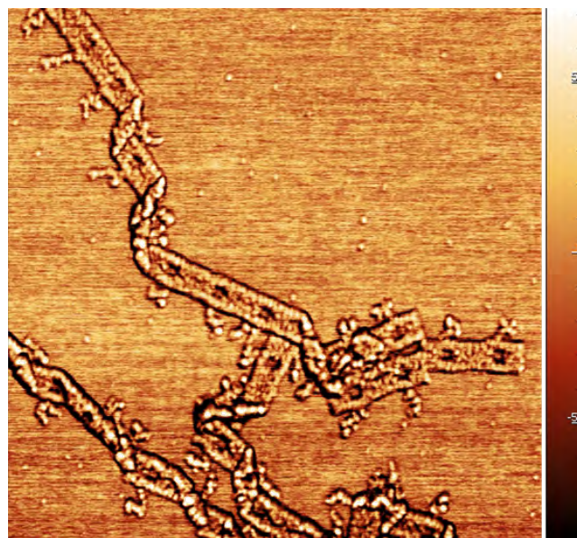
Frequency shift image

Internal structure of the DNA belt is clearly resolved in both the topography and the frequency shift channels.